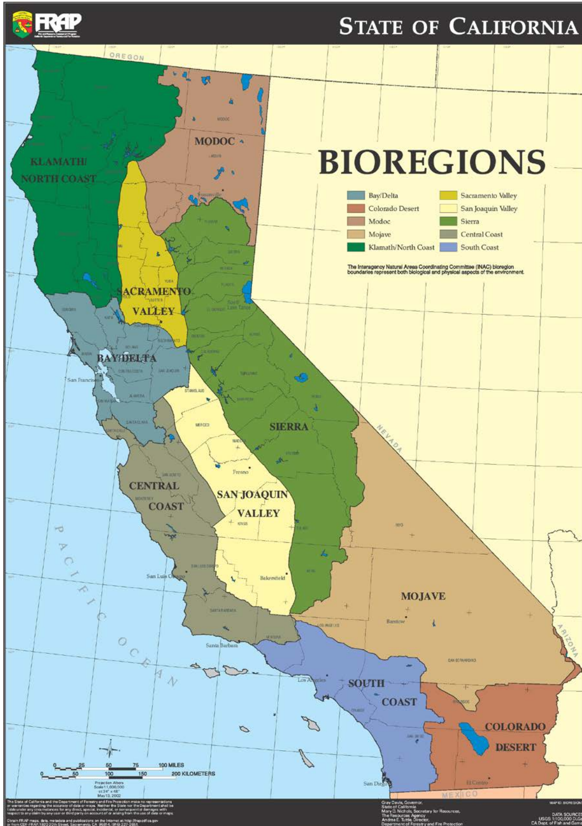
Figure 1: California Bioregions